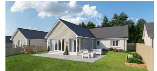
PLOT 4, KIRKFORTHAR FEUS, BY MARKINCH, KY7 6LR